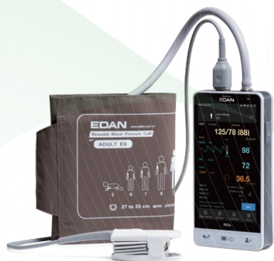
iM3s Vital Signs Monitor