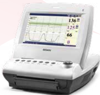
F6 Fetal & Maternal Monitor